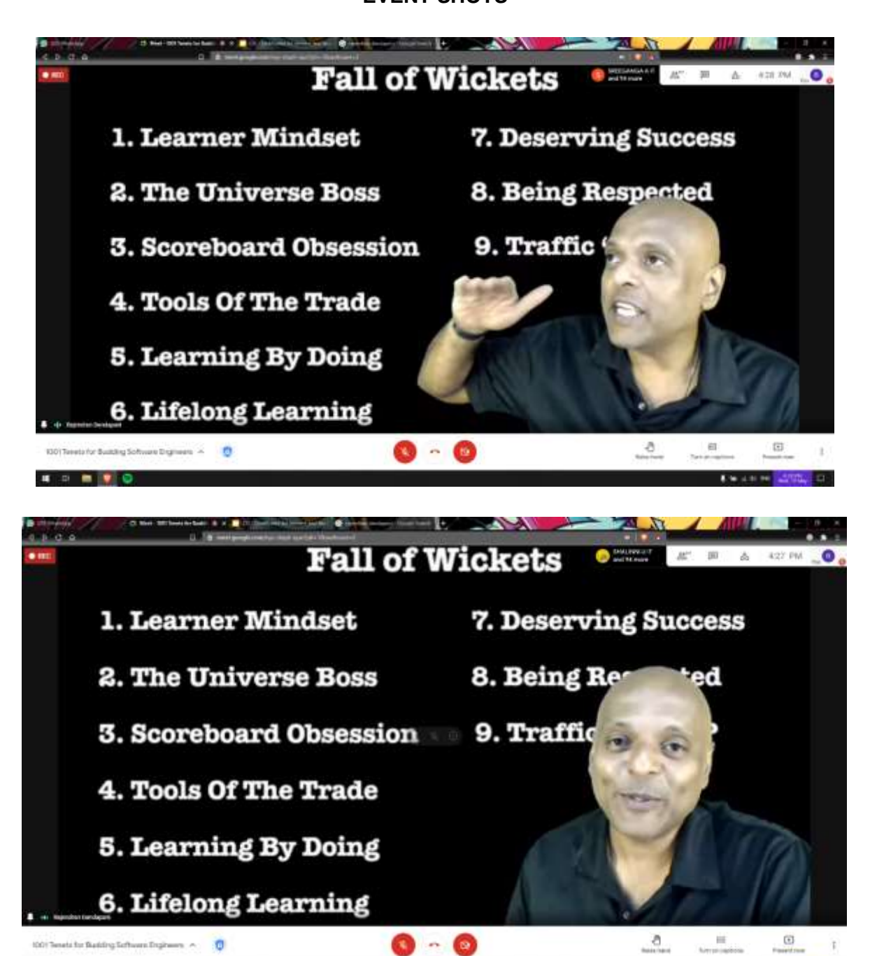
The chief guest imparts life lessons to students